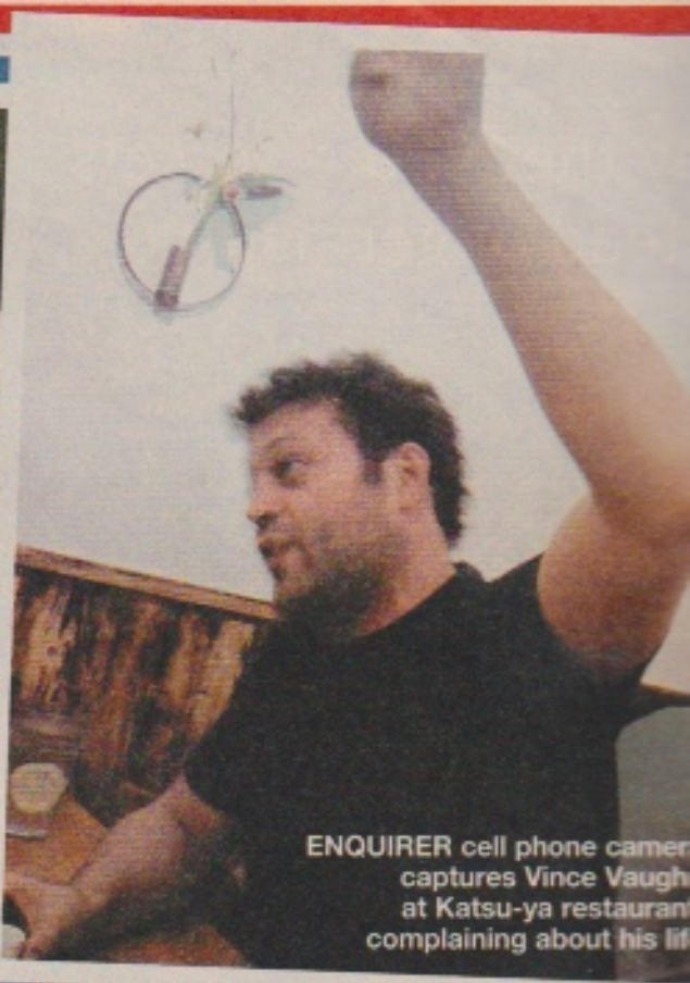
ENQUIRER cell phone camera captures Vince Vaughn at Katsu-ya restaurant complaining about his life

The romance between Vince and Jennifer took off when they filmed "The Break-Up," but last December they issued a joint statement that they decided to part ways.