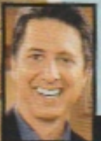
RAY ROMANO hosts this very special reunion.