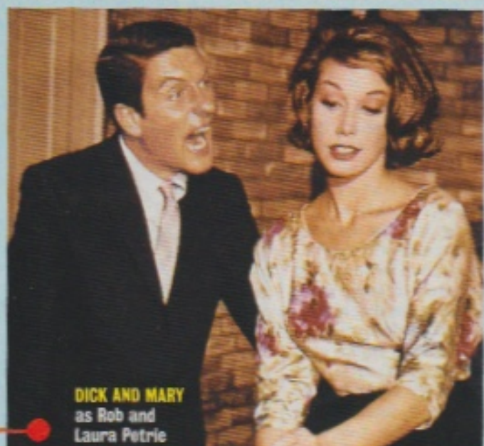
DICK AND MARY as Rob and Laura Petrie

DICK VAN DYKE & MARY TYLER MOORE When Mary and Dick left the show, they were madly in love with each other! "If we had both been single, I'm absolutely positive that we would have had a behind-the-scenes love affair," said Dick. As it turns out, the pair's friendship remained platonic. "We still love each other," said Mary. "Our mutual admiration evolved into a brother-sister type of love, but that spark of romance will always be there." Mary went on to star in "The Mary Tyler Moore Show" and the heart-wrenching movie, "Ordinary People."