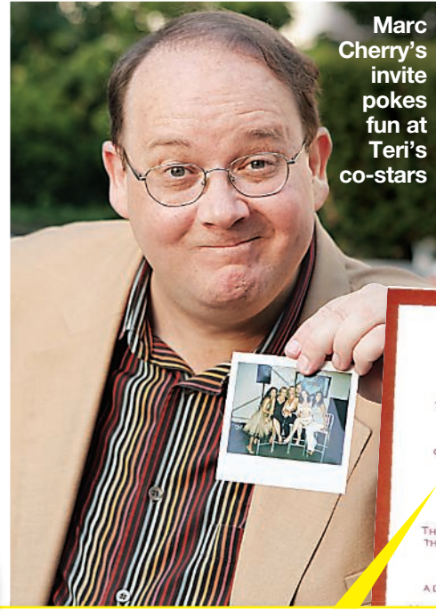
Marc Cherry's invite pokes fun at Teri's co-stars

Marc had snubbed her. Teri, 43, even called Marc's agent and "screamed" that she was so insulted she might not attend the party, continued the source.