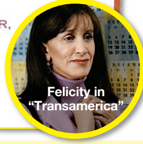
Felicity in "Transamerica"

THIS IS GOING TO BE SO MUCH BIGGER THAN GETTING MARRIED IN PARIS, (BIG DEAL ...) OR BEING NOMINATED FOR AN OSCAR, (WHATEVER ...) AND IT'S WAY MORE IMPRESSIVE THAN GIVING BIRTH TO TWINS, (SHOW-OFF ...)