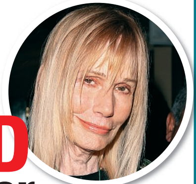
Kellerman of "M*A*S*H" fame