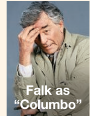
Falk as “Columbo”

In the 1970s and ‘80s, Falk was recognized by millions for his role as the rumpled, rain-coat-clad detective who always outwitted the villain. Up until recently, Peter worked regularly in both movies and television.