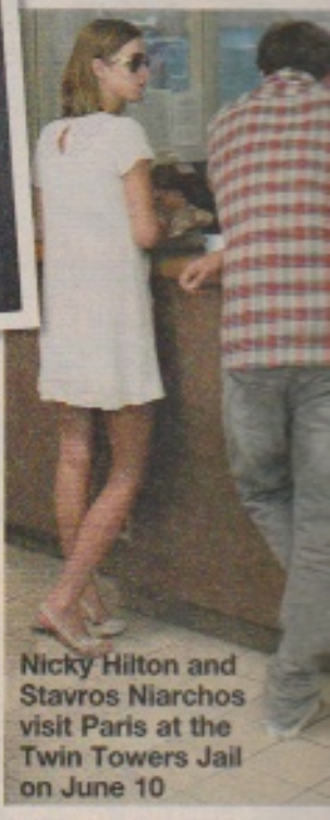
Nicky Hilton and Stavros Niarchos visit Paris at the Twin Towers Jail on June 10

T HE real reason Paris Hilton was sprung from jail after serving just three days of her sentence is because she threatened to commit suicide! Before a judge sent her back to the slammer, the 26-year-old heiress was freed to go home with an electronic monitoring bracelet due to an undisclosed medical condition – and The ENQUIRER has learned the sensational details behind her early release.