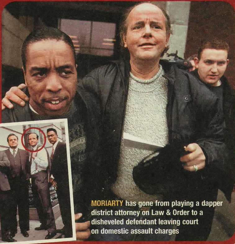
MORIARTY has gone from playing a dapper district attorney on Law & Order to a disheveled defendant leaving court on domestic assault charges