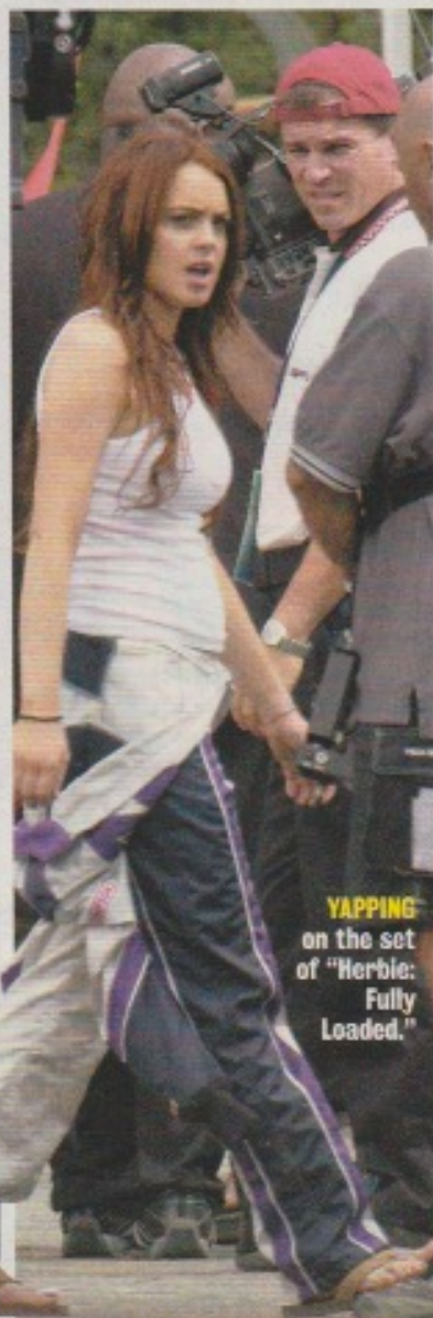
YAPPING on the set of "Herbie: Fully Loaded."

"She's managed to make enemies of her former close pal