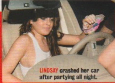
LINDSAY crashed her car after partying all night.

First with all the news, all the details