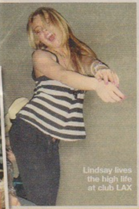
Lindsay lives the high life at club LAX

- Lindsay Lohan to a friend she sent on a drug errand