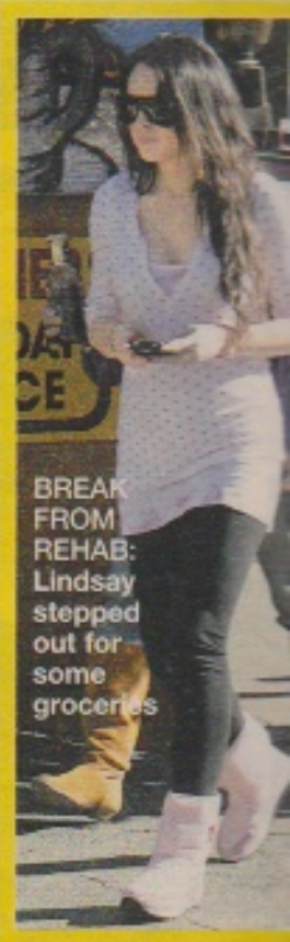
BREAK FROM REHAB: Lindsay stepped out for some groceries