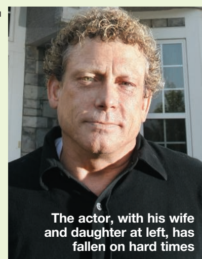
The actor, with his wife and daughter at left, has fallen on hard times

to take out a second mortgage on the couple's home in Olathe, Kan., and fell behind on payments,