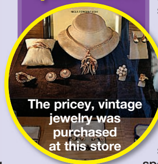
The pricey, vintage jewelry was purchased at this store

Singer buys the ring, just needs to pop the question!