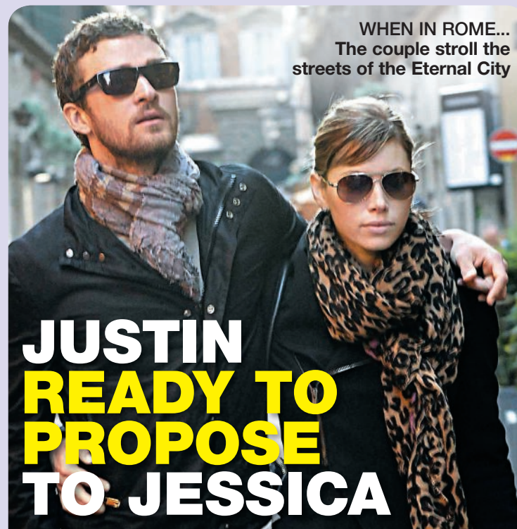
WHEN IN ROME... The couple stroll the streets of the Eternal City

by ROBIN MIZRAHI rmizrahi@nationalenquirer.com