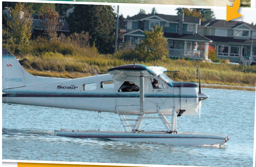
Around 35 close friends and family members boarded seaplanes that whisked them to a secluded resort for the nuptials

Even the guests didn't know where they were going