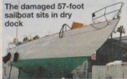
The damaged 57-foot sailboat sits in dry dock

Now, more incredible details have surfaced from that horrific night – increasing Jack's resolve to gain full custody of Lorraine, 17,