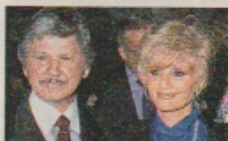
FIGHTING DAYS The macho Death Wish crime-buster often worked with his second wife Jill Ireland (above) before her 1990 death