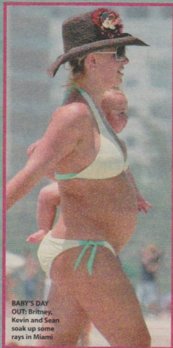
BABY'S DAY OUT: Britney, Kevin and Sean soak up some rays in Miami