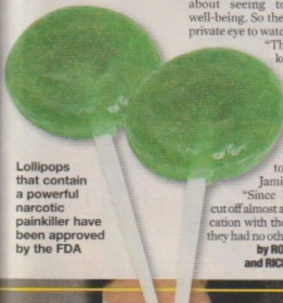
Lollipops that contain a powerful narcotic painkiller have been approved by the FDA

"Sometimes she'd pass out after sucking a morphine pop. She mixed it with alcohol and