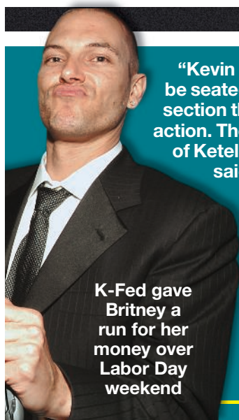
K-Fed gave Britney a run for her money over Labor Day weekend

"Kevin and his party asked to be seated in a part of the VIP section that was close to all the action. They ordered several bottles of Ketel One vodka at $350 apiece," said a source at the club.