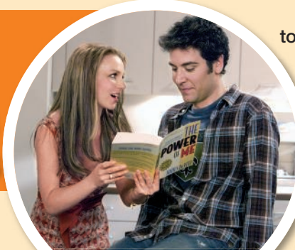
Britney landed a guest role on "How I Met Your Mother"

He is reshaping his once-unstable daughter, using