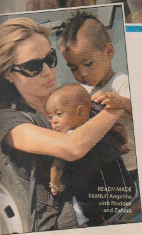
READY-MADE FAMILY: Angelina with Maddox and Zahara

A ngelina Jolie has stunned Brad Pitt with a shocking ultimatum over their future together. In a showdown between Hollywood's hottest couple, the devoted mom told Brad that her children – Maddox, four, and six-month-old Zahara – will always be hers.