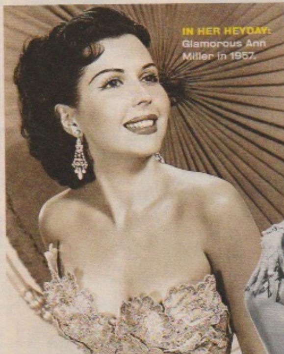
IN HER HEYDAY: Glamorous Ann Miller in 1957.