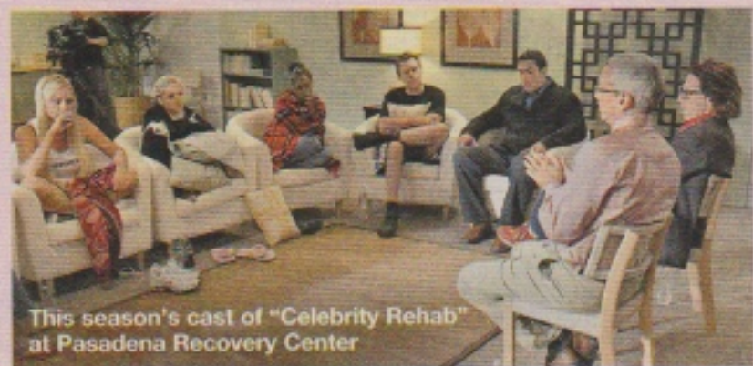
This season's cast of "Celebrity Rehab" at Pasadena Recovery Center